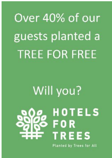
Hotel Arena - Amsterdam