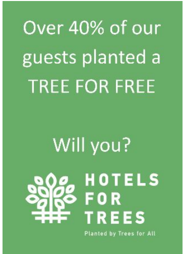
Hotel Arena - Amsterdam